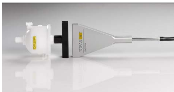
Isokinetic rectangular sampling probe for a volume flow rate of 28.3 l/min (1cf/min) at 0.45 m/s air velocity and adapter piece with HEPA filter for cleaning purposes