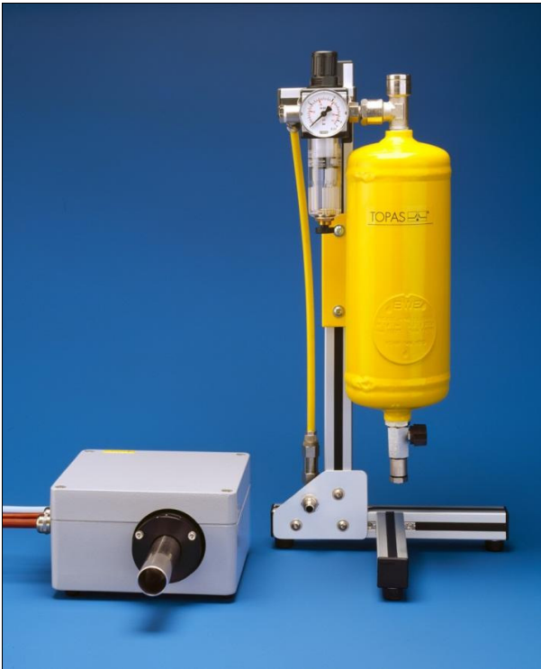
Large Droplet Generator LDG 244

For special applications requiring large oil amounts a new generator for dosing coarse disperse oils (subject to utility model protection) was developed as an attachment for the SPT 140.