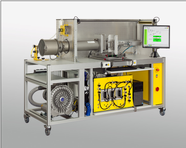
Filter test system AFC 132 / QC HEPA