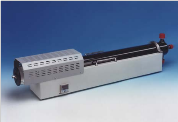
Thermodenuder TDD 590

The Model TDD 590 thermodenuder is designed to remove moisture and volatile particles from an aerosol sample for the subsequent measurement of dry particle size.