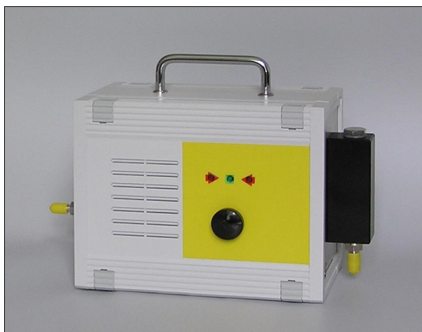
Sampling system for pressure lines SYS 525

The sampling system SYS 525 is used for purity control of ultra-pure gas supply systems and complies with the VDI 2083/7 standard in all its structural design requirements.