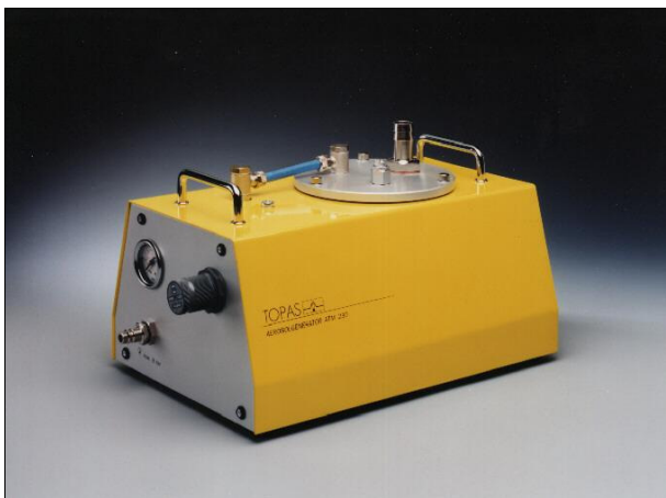
Atomizer Aerosol Generator ATM 230