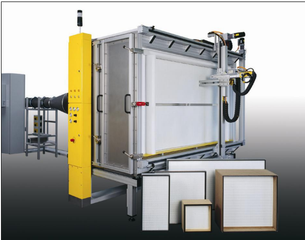
Automatic Filter Scanner AFS 150