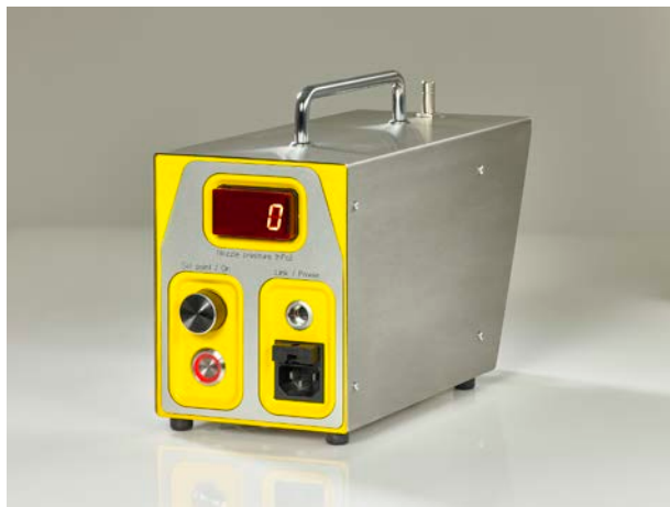
Aerosol generator ATM 228