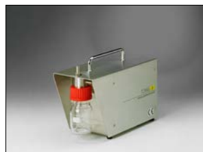
Backside of ATM 228 with atomizer glass vessel