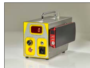
ATM 228 with external battery pack (optional)